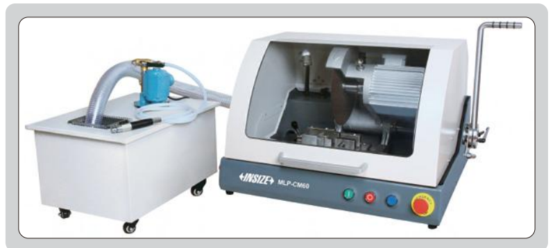
water tank (included)