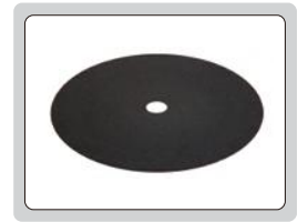
cutting blade (included)